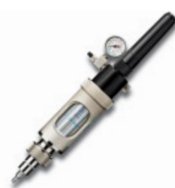
Static housing InFit 764 e

InPro 2000 and 465-50 electrodes can be used with either static or retractable housings: