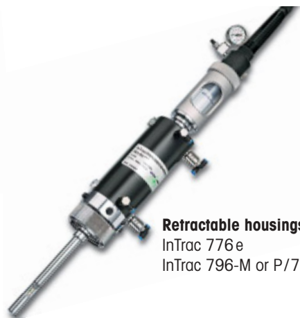
Retractable housings InTrac 776 e InTrac 796-M or P/75