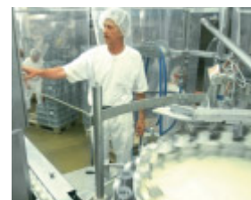
pH measurement in the food processing industry.