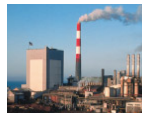
Pulp and paper industry with measuring systems.