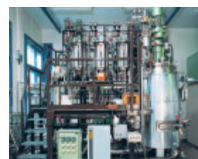
pH measurement in the biotech and pharmaceutical industries.

Certificates are provided which verify that our products will live up to the very highest expectations. They also serve to reduce the administrative effort for process documentation. We supply appropriate certificates for specific applications in the biotech, food and pharmaceutical industries (EHEDG, biocompatibility, FDA-approved materials), as well as in the chemical industry (ATEX/FM, certification in line with PED guidelines (European Pressure Equipment Directive)).