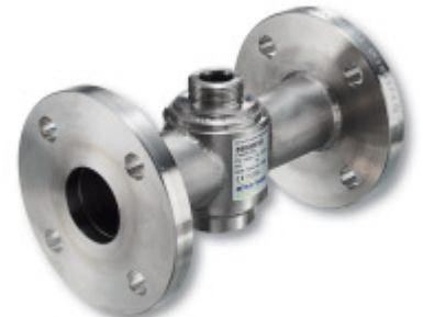
Flow-through housing InFlow 761