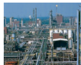
Chemical industry with pH measuring systems.